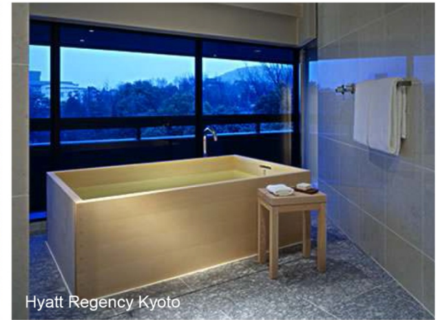
Hyatt Regency Kyoto