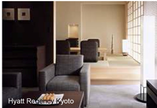
Hyatt Regency Kyoto