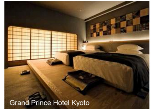
Grand Prince Hotel Kyoto