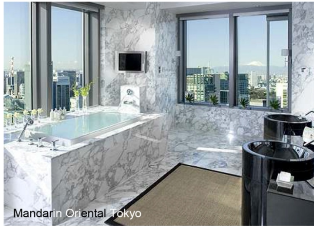
Mandarin Oriental Tokyo