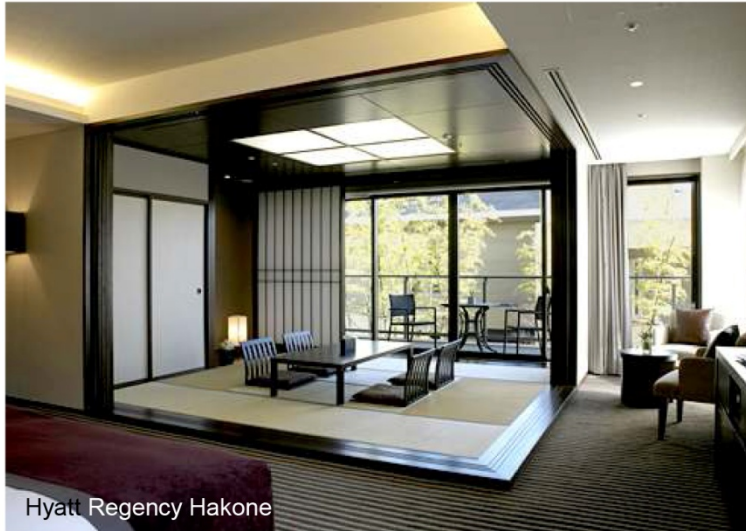
Hyatt Regency Hakone

The traditional high-class Japanese-style hotel, ryokan , is the best place to experience the elements of Japanese culture. The Japanese-style architecture and garden views of ryokans embody Japanese essence such as Wabi and Sabi. Guest rooms are normally all suites with tatami mat floor crafted from rush grass, paper sliding fusuma doors, paper shoji screens, Japanese low table and seats, an ornamental tokonoma alcove and Japanese-style bed futon . Luxury hotels in Japan often have suites inspired by ryokan .